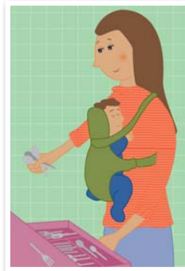
In a sling – a useful way of keeping close to your baby, with your arms free to do other things

Babies also like stroking and gentle massage.