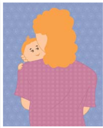
Upright looking over your shoulder, with their head supported