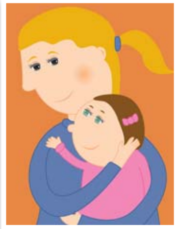
Cuddled up close to you