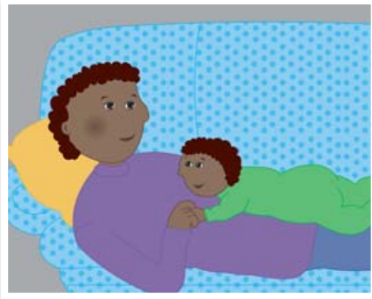
Lying on top of your chest (but avoid this if you have been drinking or smoking)