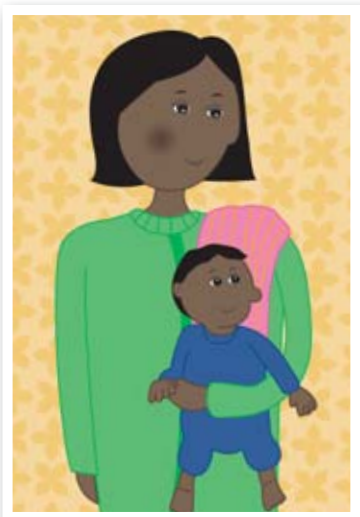
With your arm around their tummy, and their back against your body